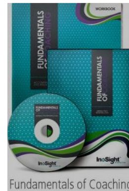
Fundamentals of Coaching