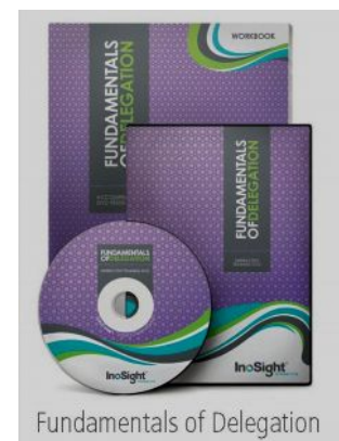
Fundamentals of Delegation